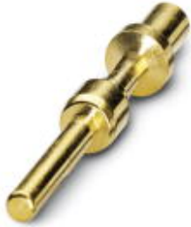
Crimp contact, turned, Single contact, contact diameter: 3.6 mm, crimp range: 4 mm 2 ... 6 mm 2

Please be informed that the data shown in this PDF Document is generated from our Online Catalog. Please find the complete data in the user's documentation. Our General Terms of Use for Downloads are valid ( http://phoenixcontact.com/download )